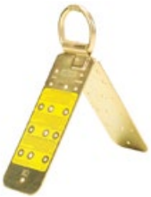
REUSABLE ROOF ANCHOR 10102686

A personal fall protection system is only as strong as its components. Selecting an appropriate Safety Works anchor point, is an essential part of a fall protection system.