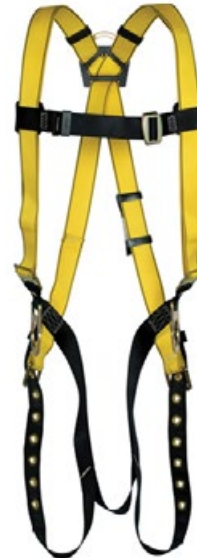
ADJUSTABLE FULL BODY HARNESS WITH THREE D-RINGS 10096481 Standard 10096491 X-Large