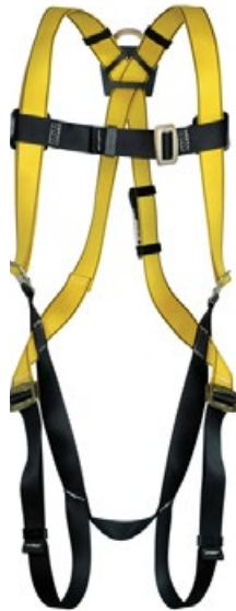
ADJUSTABLE FULL BODY HARNESS WITH ONE BACK D-RING 10096486 Standard 10096580 X-Large

Making sure that workers are comfortable and safe is a top priority at Safety Works. With Safety Works lightweight harnesses, safety is made simple.