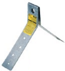
TEMPORARY ROOF ANCHOR 10096540