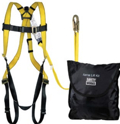
AERIAL LIFT KIT 10096535 Standard 10095849 X-Large